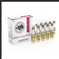
Buy Magnum Test-Plex 300 Online