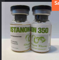
Buy Sustanon 350 Online