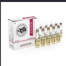
Buy Magnum Test-R 200 Online